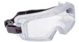
1686101 • Clear Indirect Vents