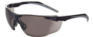
1653602 • Smoke Lens