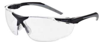
1653601 • Clear Lens